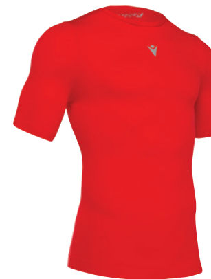
02 ROSSO RED