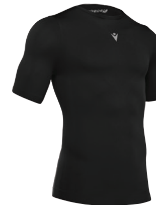
09 NERO BLACK