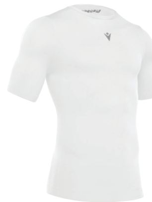
01 BIANCO WHITE